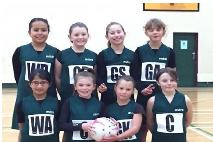
Our Year 4 Pulse team

Good luck to all the teams and enjoy your netball.