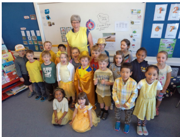
Having fun and dressing up in Room 4