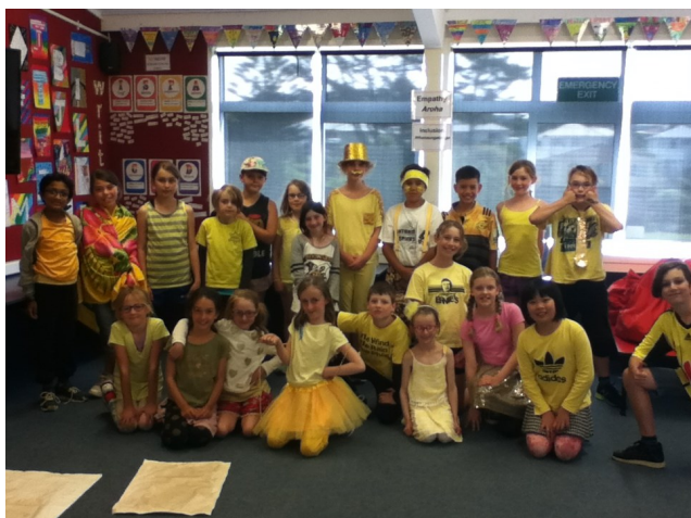
A golden glow from Room 15

We appreciate everyone contributing a gold coin or two for the daffodil bulbs legacy project. We raised a grand total of $338 towards these, and look forward to planting them out soon so that they will be ready for our special celebration events in the weekend of 15 and 16 September.