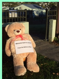
Monday's welcoming committee

All our parents/whānau who helped prepare their children for the return to school, also to the staff who were on the gates welcoming back students this week (along with some other 'friends') so that there were smiles as children said 'goodbye' and came into the school grounds. Tino pai rawa koutou.