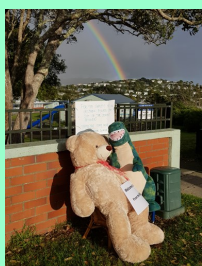
Tuesday's welcoming committee